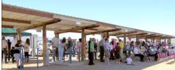
Community members gather together before the Dedication and Renaming of the range.