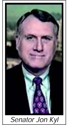
Senator Jon Kyl