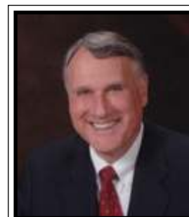
Senator Jon Kyl