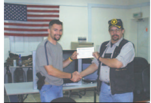
"A recent Bhagdad Instructor Grad"